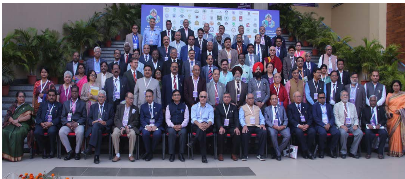
93 rd Annual General Meet and National Seminar on Autonomy for Excellence in Higher Education organized by Association of Indian Universities on 16 th – 18 th February 2019